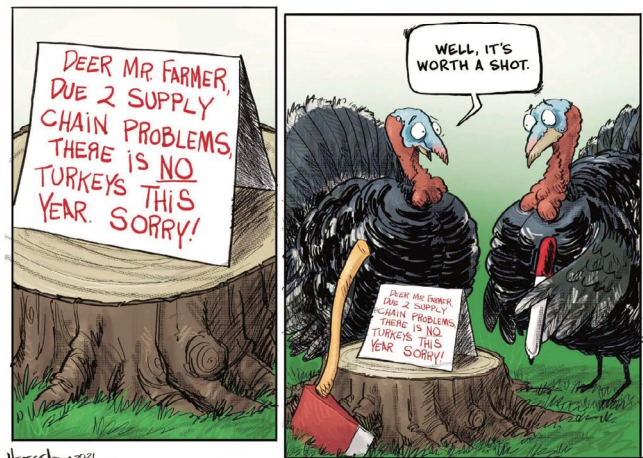
Necessity 2021 THE CUCUMBER ENDORSEMENT